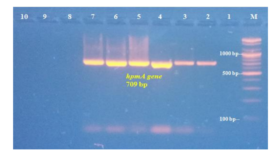
Figure 1. Agarose gel electrophoresis of PCR products for hpmA gene (709 bp). Lane M: 100bp DNA ladder; lanes 2-10: P. mirabilis PMK1-PMK9 isolates; lane 1: Negative control. (80V for 2hr).

DNA extracted sample have been used. The PCR reaction included 110 isolates for detection the genes. The PCR products have been confirmed by analysis of the bands on gel electrophoresis and by comparing their molecular weight with 100 bp DNA Ladder. The results of uniplex PCR reaction for hemolysin genes showed in Figures (1) and (2), and these genes also detected by multiplex PCR reaction (Figure 3).