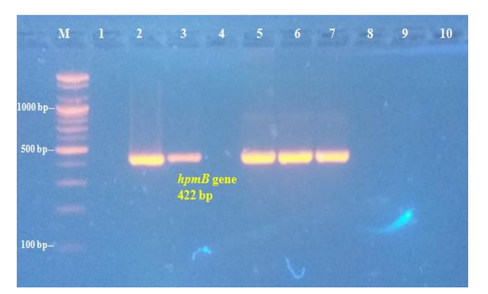
Figure 2. Agarose gel electrophoresis of PCR products for hpmB gene (422 bp). Lane M: 100bp DNA ladder; lanes 2-10: P. mirabilis PMK1-PMK9 isolates; lane 1: Negative control. (80V for 2hr).